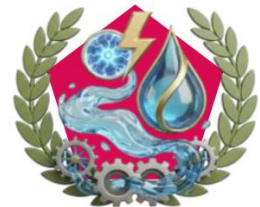
ENERGY AND WATER